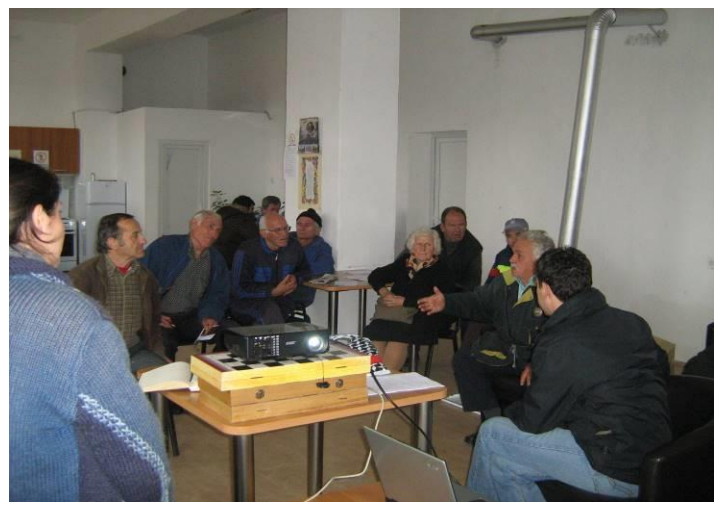
Figure 2: One of the meetings to improve internal structure in NAPFO Macedonia

independent entities at municipal level as APFO. In 2010, 9 local associations with 330 members were established in addition to the national association. In 2011, the number of local associations increased to 16 with 640 members, while the national association was reorganised and became the National Association of Private Forest Owners (NAPFO) as network and umbrella organisation representing the local associations. In 2012, the number of members of the 16 associations increased to about 3,600 while the establishment of additional associations was in process. The project has established associations in all municipalities (16) of three regions in Kosovo, while an additional two are in process outside of these regions.