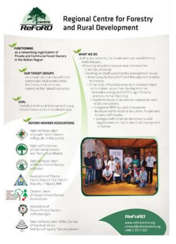
Figure 14: REFORD promotion poster

The associations for private and communal forestry in the different countries are still growing and developing. REFORD as their regional network for family forestry is a young structure that is gradually growing. The whole forestry sector in the regional and proper inclusion of family forestry and sustainable forest management needs further attention.