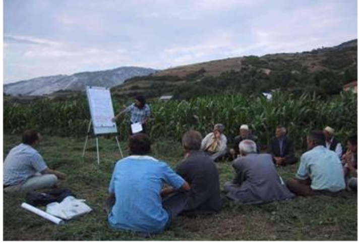
Figure 3: One of the early meeting of the Communal Forest Association in Albania

In Macedonia in 1997 a group of private forest owners established APFO - Association of Private Forest Owners in Macedonia. In 2006 APFO was still a small association with about 35 members and mainly focused on lobbying for legal adjustments to support private forestry. From 2006 onwards APFO supported by the SNV/CNVP forestry programme improved its internal structure by having one head office in Berovo, 5 regional offices, 25 branches and increased the membership to over 1600 members. Through these new developments APFO became a national association representing all private forest owners in Macedonia (NAPFO) with a main mission to address and protect the private forest owners and users individual and common interests. With the continued support of the CNVP/Sida project NAPFO was able to further strengthen its capacities. Effective lobbying brought for the first time some positive changes in private forestry. A significant policy achievement was the active involvement of NAPFO in process of coming to the new Forest Law in 2008 which was amended in later years. NAPFO was included as one of the main stakeholders in the process. Through their lobby NAPFO managed having the possibility for licensed forest engineers to provide forest services.