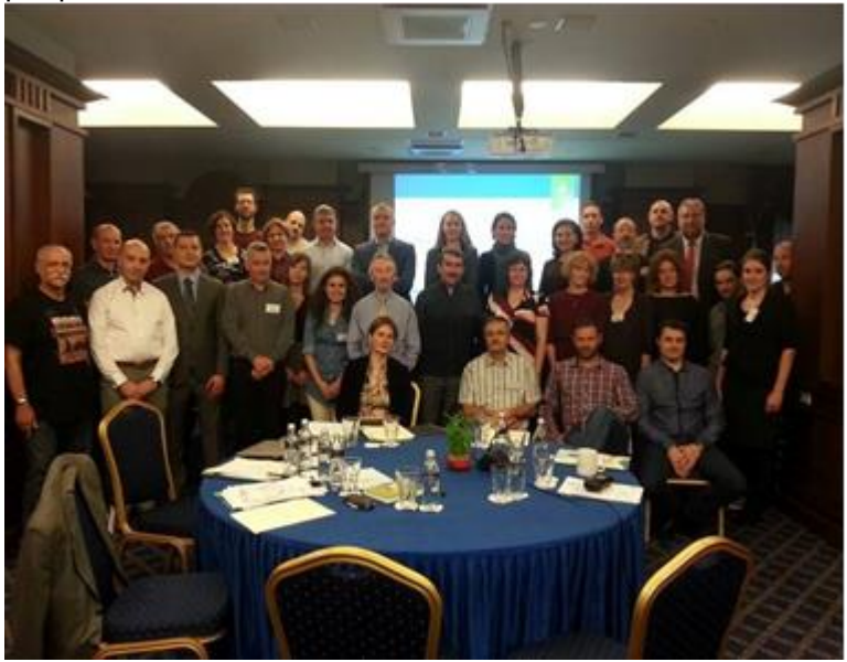
Figure 7 Group picture during the FAO Technical Workshop on Voluntary Guidelines on the responsible governance of tenure of Land, Fisheries and Forests

REFORD aims to be an umbrella organization for all private and communal forest owner associations in the region. Strengthening its position in the wider Balkan region REFORD strives to become recognized service provider in the fields of forestry, rural development, natural resource management and biomass utilization (especially wood biomass). While expanding the network further trough the region REFORD is improving the position of private and communal forestry and contributes to enhance rural economy and life of local people.