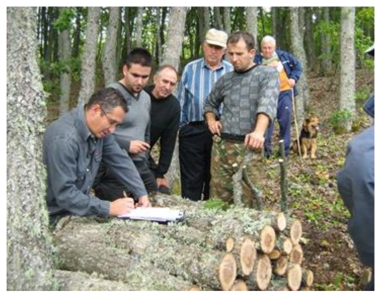
Figure 10 Delivering training for private forest owners in Macedonia

In Kosovo a start is made with developing management plans for small scale private forest, while in Albania forest management planning through forest parcel plans and some wood products business plans started. Developing business services for owners and users provided a direct service requested for by people and is linked to the development of the associations as this is an important role of the associations and is important for the associations own financial sustainability.