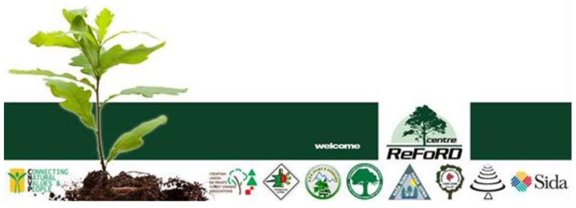
Figure 13: By 2013 REFORD increased its membership to 7 member organizations

The main aim of REFORD is bringing the collaboration between the Balkan family forest associations on a higher level, creating more opportunities and improving the services they provide to the people. Compared with the situation in 2009, when the project started, the biggest development is that a functional regional private and communal forestry network exist. Network members effectively exchange and cooperate on joint learning and development of forestry practices and methods and jointly address and advocate relevant private and decentralised forestry issues.