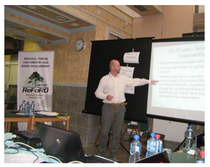
Figure 12 REFORD facilitating FAO regional workshop "Supporting non-State forestry in South East Europe"

Currently the main income for the associations is derived from donors via projects. This is logical since support was needed in the start and set up of the family forestry structures. Dependence on such support however should not remain long term and needs to be diversified with other sources and gradually taken over by other sources. Depending on the level of development of the associations; membership fees and project implementation is providing already some income.