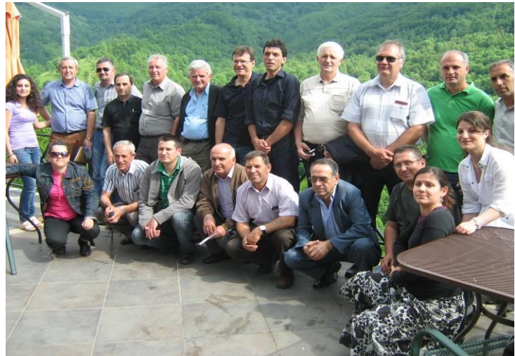
Figure 5: REFORD Assembly meeting, Kosovo, June, 2011

While sharing similar challenges about private and communal forestry the three associations where exchanging and building their relationships. Using the existing local organizations and their capacities they initiated discussions about joining forces in addressing concrete common issues and finding solutions on regional level. The CNVP/Sida forestry project provided a platform for this vision and encouraged the associations to start structuring their regional ideas.