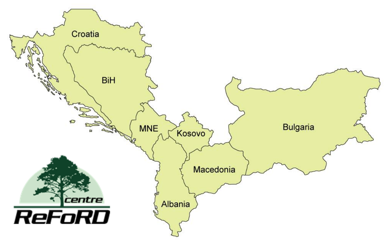
Figure 6: REFORD coverage in the Balkans

In the spring of 2010 on the Assembly meeting held in Brezovica, Kosovo was decided that official members of REFORD are only legal entities. REFORD is a network organisation of which only other organisations in the field of family forestry can become members. To address this in the end of 2011 through two preparatory meetings the member associations from Albania, Kosovo and Macedonia discussed about the organizational structure, statute, election bodies and other issues that needed improvement. On the Annual meeting held December 2011 in Albania the associations from Albania, Macedonia and Kosovo voted for changes in the Statute and formed new board with proper representation of members.